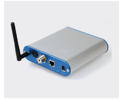
Coloured end panels available upon request